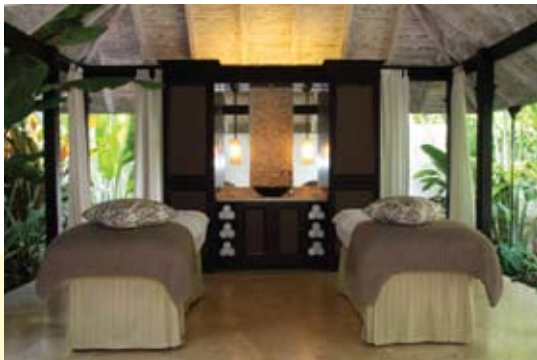
The Outdoor Double Treatment Pavilion