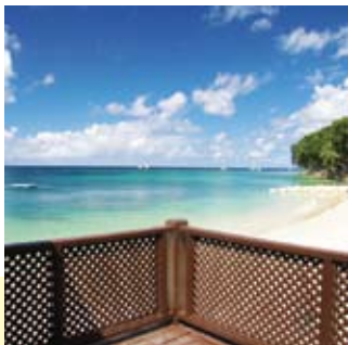
View from The Beach House

The Beach House is located on the southern side of the seafront at The Sandpiper. When our longtime family friends decided to sell at the beginning of the summer, we were thrilled to be able to acquire the three bedroom house. Incorporating The Beach House to Sandpiper involved building a boardwalk access from the hotel, echoing Sandpiper's colour scheme in the woodwork and installing new landscaping. These alterations have resulted in The Beach House perfectly integrating to The Sandpiper.