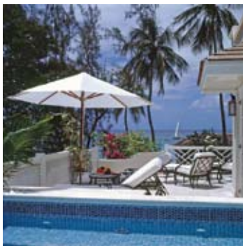
Left: Luxury Plantation Suite Pool Right: Coral Reef Club's Beach

The Plantation Suites at Coral Reef Club have been refurbished with stunning new interiors and whilst the essence of the original style has been retained, there is a fresh, more contemporary approach. Helen Green Designs has developed inspired schemes that ensure that the Plantation Suites remain at the forefront of the world's most stylish suites.