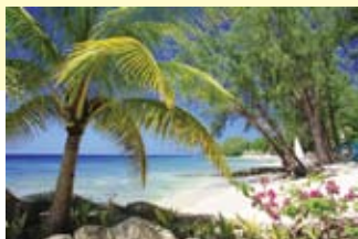
Coral Reef Club's Beach

It is certainly no secret that 2010 was equally as difficult a year, if not more so, for the Barbados economy than 2009. The ongoing downturn has resulted in a number of Government initiatives to be postponed and not least of which is the beach restoration project that we have been speaking about for the past two years.