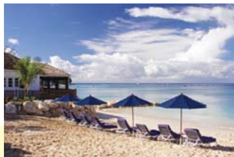
The Beach House

The Beach House consists of a luxurious master bedroom which leads directly onto a large wrap around terrace, located immediately over the beach with the sea just feet away. The master bathroom consists of a tub and walk-in shower. The bright and spacious living room also opens directly onto the terrace with a series of French doors. Dining and comfortable chaise longue chairs make this a most enticing place to relax. A fully fitted kitchen allows for independence should guests wish to cater for themselves.